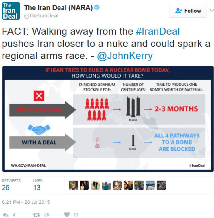
Figure 8. Tweets making claims to facts.

When comparing the first and second time intervals, it was discovered that seven categories were excluded from the @TheIranDeal Twitter channel. Three of these categories dealt with the dangers of non-ratification including the loss of ability to monitor Iranian nuclear facilities, the reduced Iranian breakout time and Iran's ability to secretly enrich uranium. Additionally, the category depicting the Iran agreement as a boost to global security was excluded as well, as were the categories dealing with the release of US citizens held in Iran and continued US scrutiny over Iran's conventional weapons program. The final category to be excluded stated that sanction relief would be dependent on Iranian compliance with the agreement. To test H4, the average number of re-Tweets of each excluded category was calculated and compared to all other categories in the same DWS argument. This measurement, which was based on a sample of 100 Tweets, can be seen in the table below.