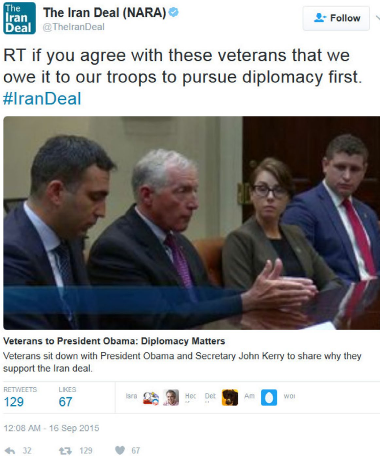
Figure 13. An opportunity for co-dissemination of content.