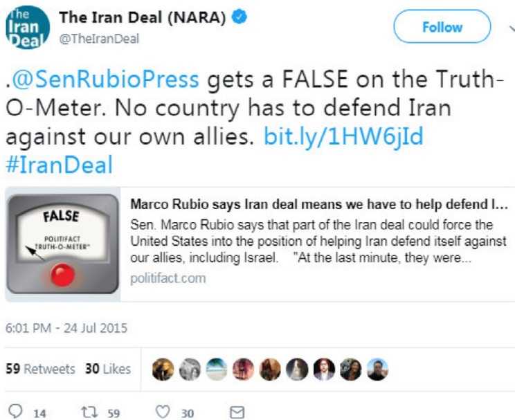
Figure 11. Tweet measuring the reliability of statement by Senator Marco Rubio. Source: Image from The Iran Deal Archived Twitter channel. (Link: https://twitter.com/TheIranDeal/status/624595262221070336 )

To summarize, the results presented in this section suggest that the arguments invoked by the @TheIranDeal channel changed throughout the campaign. Results indicate that some of these changes correspond with follower feedback (that is, average number of re-Tweets). There were also multiple instances in which the @TheIranDeal channel directly refuted arguments raised by other actors, be they domestic or foreign. Thus, hypotheses H4a/b were partially validated.