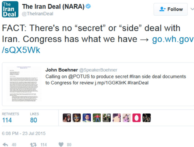
Figure 10. Tweet directly refuting argument by the Speaker of the House.