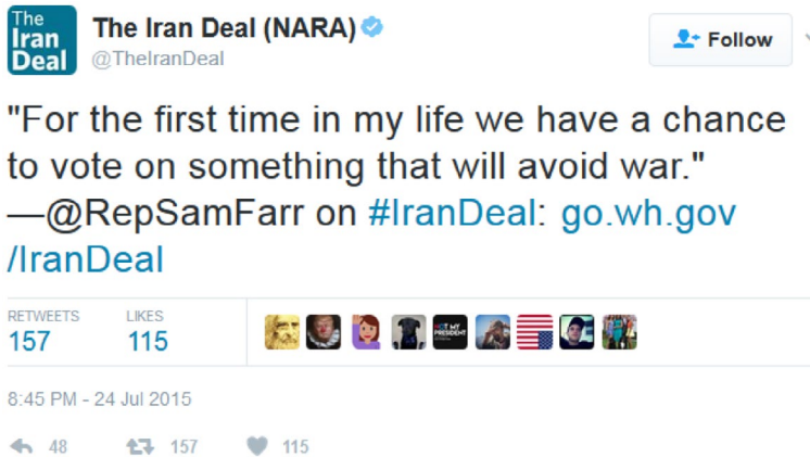
Figure 4. Tweet portraying Iran Deal as peaceful solution to the Iranian crisis.