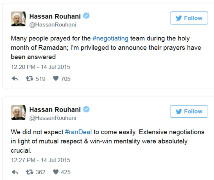
Figure 2. President Rouhani praises Iran's newfound respect.