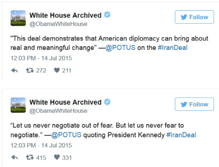
Figure 1. President Obama framing Iran Deal as diplomatic accomplishment.

Source: Images from Obama White House Archived Twitter Channel. (Links: https://twitter.com/ObamaWhiteHouse/status/620911474655936512?ref_src=twsrc%5Etfw&ref_url=https%3A%2F%2Fdigdipblog.com%2F2015%2F07%2F14%2Fthe-framing-of-irandeal-on-digital-diplomacy-channels%2F&tfw_site=wordpressdotcom ; https://twitter.com/ObamaWhiteHouse/status/620911544130383872?ref_src=twsrc%5Etfw&ref_url=https%3A%2F%2Fdigdipblog.com%2F2015%2F07%2F14%2Fthe-framing-of-irandeal-on-digital-diplomacy-channels%2F&tfw_site=wordpressdotcom )