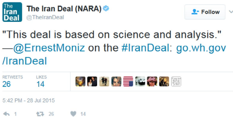
Figure 6. Statement by Secretary of Energy Moniz.

Source: Image from The Iran Deal Archived Twitter channel. (Link: https://twitter.com/TheIranDeal/status/626040127920320512 )