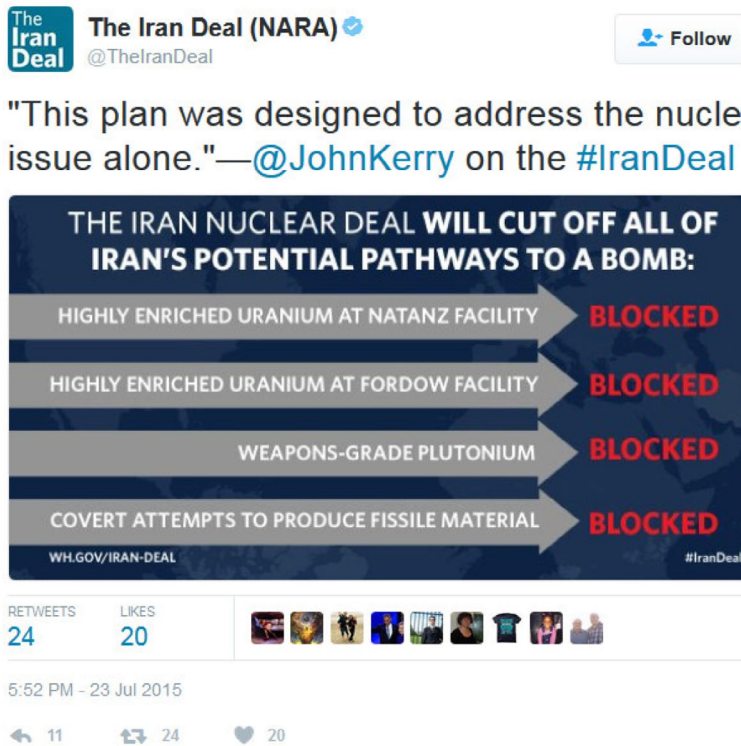
Figure 7. Statement by Secretary Kerry that Iran Deal was meant to deal with one issue alone.

Two additional categories identified during August were part of the 'Wide Support' theme. These categories depicted instances in which US army veterans and Christian ministers lent their support to the Iran agreement.