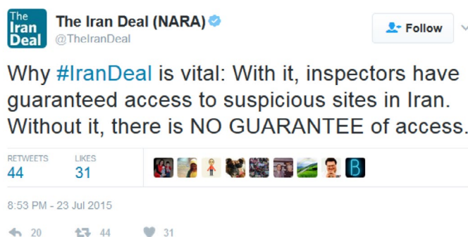
Figure 3. Tweet demonstrating the dangers of non-ratification of Iran Deal.