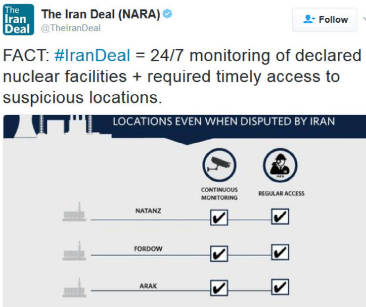
Figure 5. Tweet stating Iran Deal is based on verification and not trust.