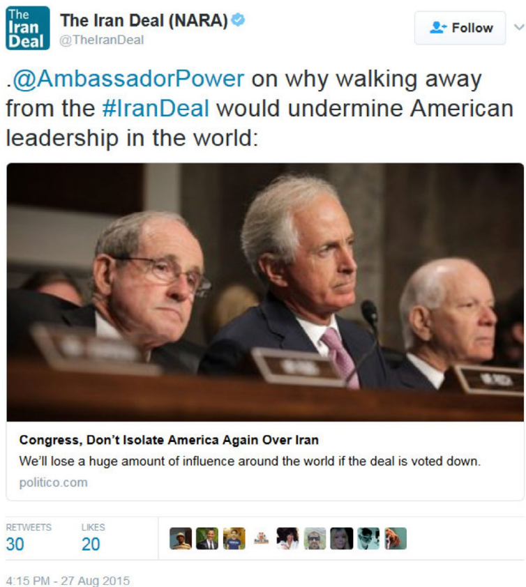
Figure 9. Tweet demonstrating the danger of non-ratification of Iran Deal.