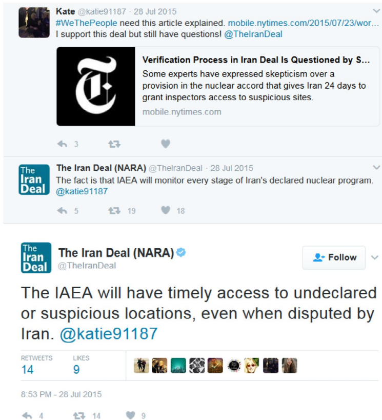
Figure 12. Iran Deal Twitter channel answering a follower's question. (Link: https://twitter.com/TheIranDeal/status/626088018248601604)

results demonstrate that the Obama administration used Twitter to make cogent arguments to increase DWS. The first argument attempted to raise awareness about the perceived cost of non-ratification by emphasizing the possible loss of ability to monitor Iranian nuclear facilities, the reduction in Iranian breakout time and the danger to Israel. The @TheIranDeal channel also suggested that non-ratification would lead to a different, and more dangerous, reality thus framing non-ratification as the opposite of the status quo. These findings validate this study's first research hypothesis. It should be mentioned that the Obama White House went to great lengths to depict Israeli security specialists' support for the Iran agreement. This finding demonstrates yet again the interaction between the two levels of diplomacy as a Level 1 actor can become the subject of debate in Level 2 deliberations.